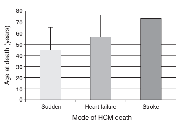
Figure 2 Mode of HCM death according to age. 3

In 2009, using a definition that includes the whole of the transcontinental countries of Russia and Turkey 8 , the population of Europe was about 830.4 million (slightly more than 13% of the world population). The exact figure depends on the definition of the geographic extent of Europe, as in 2008