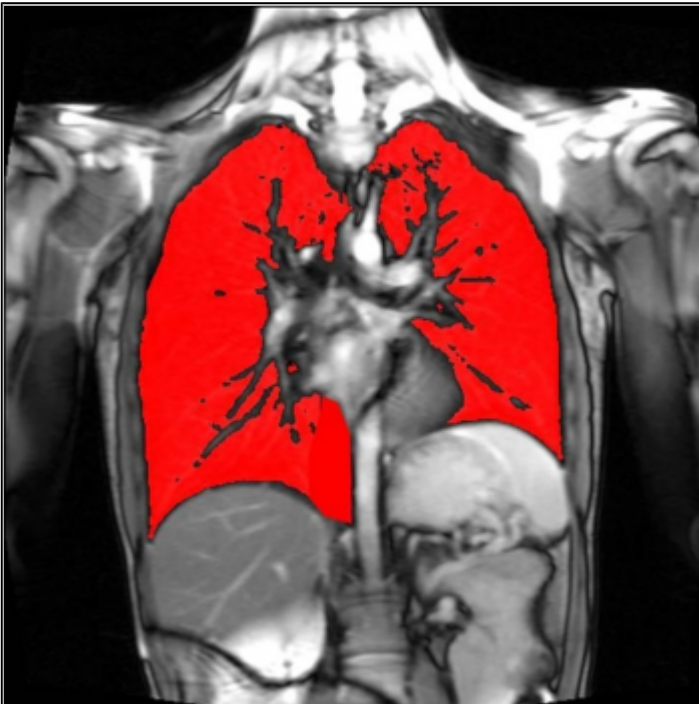
Figure 2 Functional MRI

Coronal True FISP MR image of the thorax (TR: 337ms, TE: 1,33ms) in maximum inspiration showing the segmented lung areas (red color) of both hemithorax.